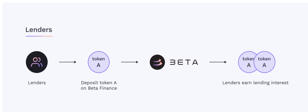
Figure 1: When depositing, the deposited asset will be transferred to its respective BToken contract, minting bTokens for the depositor, and accrue interest for the depositor.