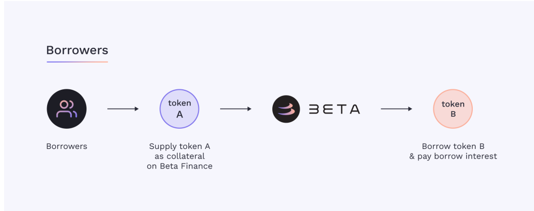
Figure 2: When borrowing, borrowers must first supply a collateral token that is the borrower's limited liability for the position. Afterwards, the borrowed token is sent to the user and interest must be paid when closing out the position to retrieve collateral.

When borrowing, to protect from immediate liquidations, the LTV ratio of the current position must be below the safety LTV defined by the configurator. For example, if the safety LTV is 60% and collateral factor is 80%, then a user is only able to borrow at most 48% of the value of the collateral asset. While the LTV can grow above 60% after a position is initiated, a user will not be able to borrow without depositing additional collateral to reduce the LTV.